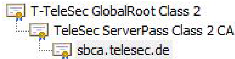
Figure 2: Overview of the “sbca.telesec.de” web server’s certificate hierarchy