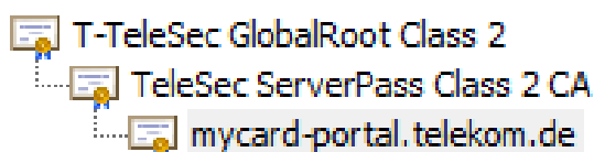
Figure 2: Overview of the certificate hierarchy of the "mycard-portal.telekom.de" web server

Figure 2 presents the certificate hierarchy of the " https://mycard-portal.telekom.de " web server with the corresponding certificate from the root certification authority (root CA) and the intermediate certification authority (sub CA). This web server can only be accessed from the DTAG intranet.