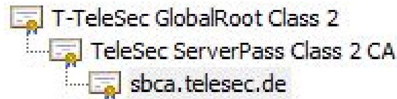
Figure 2: Overview of the “sbca.telesec.de” web server’s certificate hierarchy

Figure 2 presents the certificate hierarchy of the “sbca.telesec.de” web server with the corresponding certificate from the root certification authority (root CA) and the intermediate certification authority (subordinate certification authority, sub CA).