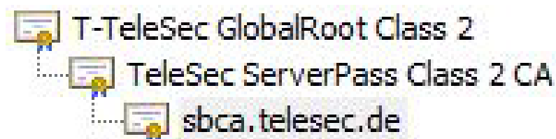
Figure 2: Overview of the “sbca.telesec.de” web server’s certificate hierarchy

Figure 2 presents the certificate hierarchy of the “sbca.telesec.de” web server with the corresponding certificate from the root certification authority (root CA) and the intermediate certification authority (subordinate certification authority, sub CA).