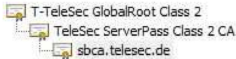
Figure 2: Overview of the “sbca.telesec.de” web server’s certificate hierarchy